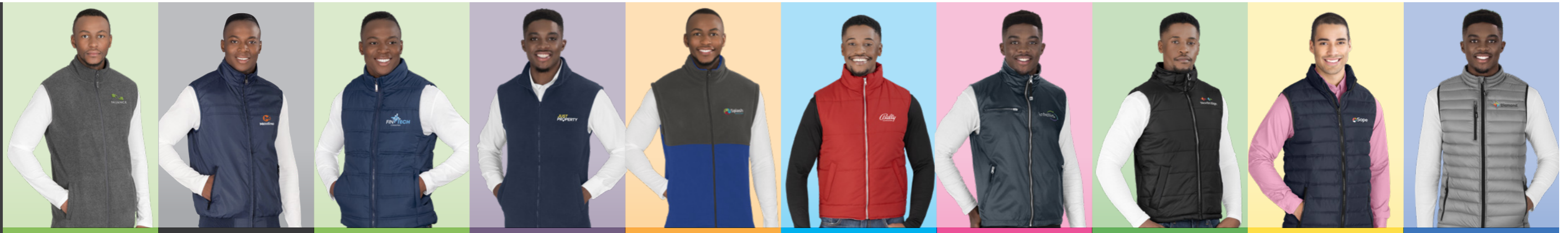
ALT-OSBM ALT-COBM ALT-LND BAS-8004 BAS-5165 BAS-820 SLAZ-813 SLAZ-7608 ELE-9600 ELE-7410